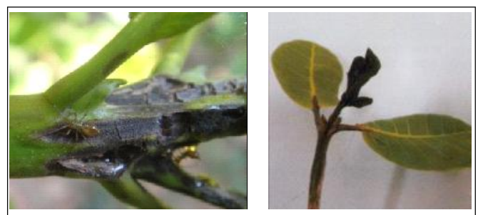
Damage symptoms of Tea mosquito bug

- Heavily infested trees show scorched appearance, leading to the death of shoots and growing tips.